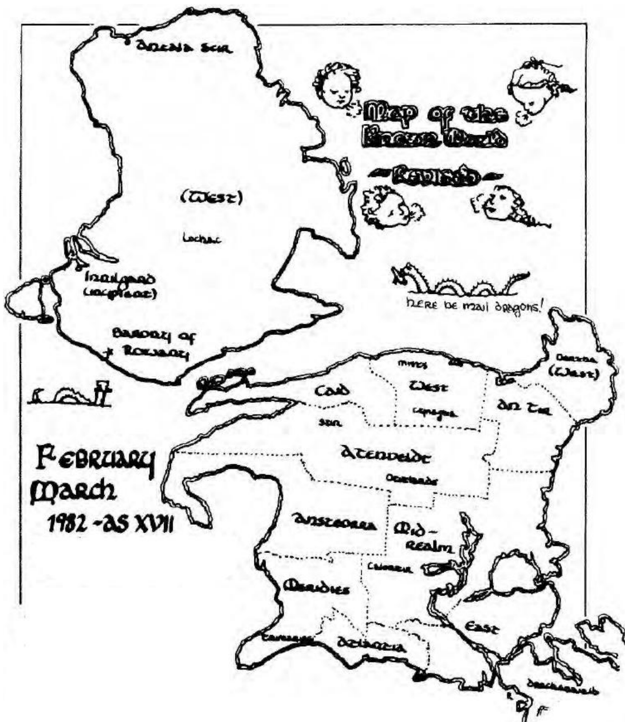
Figure 5: Map of the Known World (including Lochac) as published on the front cover of Runes issue 10, February 1983, by Rowan Perigrinne.

The first published map of Lochac was drawn around the time Lochac was proclaimed a Crown Principality and appeared in the 10 th issue of Runes .