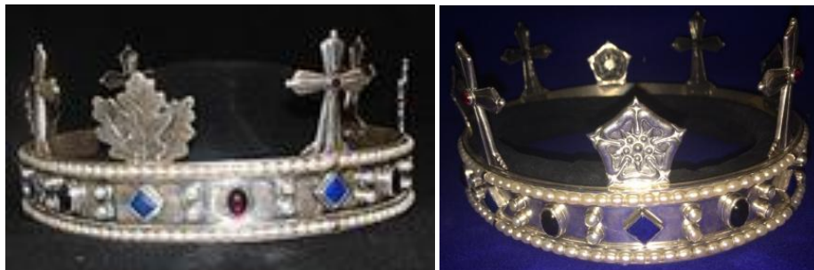
Figure 6: King (left) and Queen (right) crowns

Lochac also uses a pair of travel Crowns. They are lighter and easier to transport than the official Crowns, and are sometimes used as the primary Crowns for reigns based in an early period.