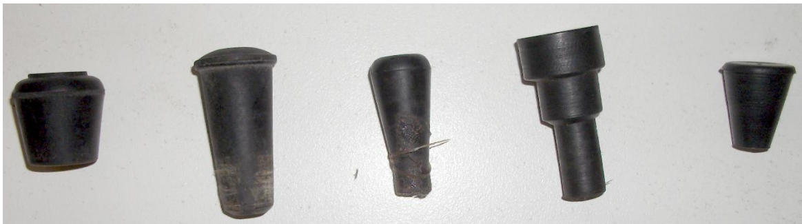
Figure 9: Lochac combat arrows are made of wooden shafts, feather fletchers, and rubber blunts. Photo by Ciaran Shiranui, 2015.