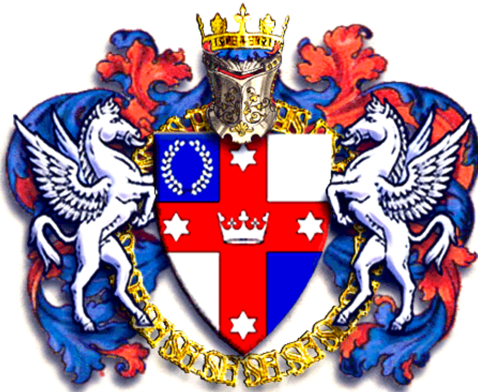
Figure 1: Rendering of the Lochac Kingdom Arms, incorporating the pegasi supporters, the Crown of Lochac, and the fealty chain of SF (Semper Fidelis). Image rendered by Mistress Roheisa Le Sarjent of Southron Gaard.

The Southern-most Kingdom where, if the fauna doesn't get you, the landscape will.